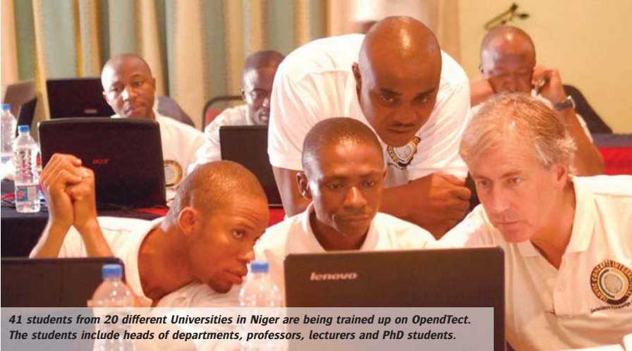
41 students from 20 different Universities in Niger are being trained up on OpendTect. The students include heads of departments, professors, lecturers and PhD students.

It is essential that effective knowledge transfer is established between the commercial oil & gas sector and university students and graduates.